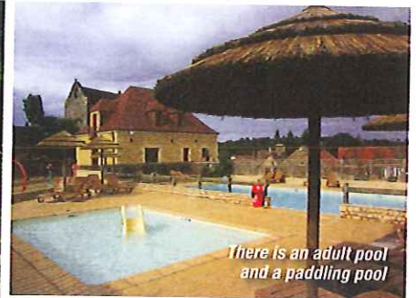
There is an adult pool and a paddling pool