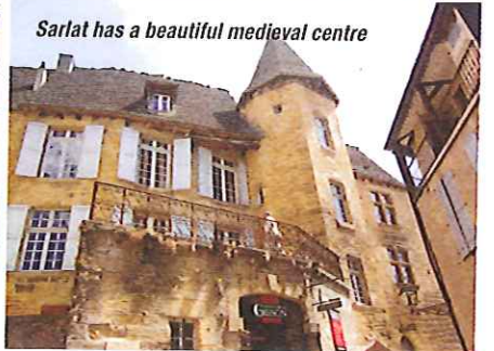
Sarlat has a beautiful medieval centre